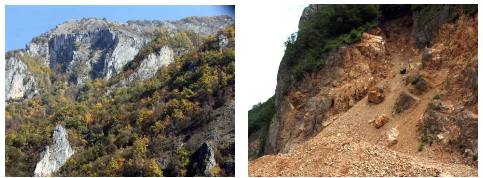
Figure 4. Details from the Canyon of the Pisevska Rijeka, close to the inflow

The study area characterize hilly-mountainous topography with many steep slopes from which the water runs off and flows quickly. That is favorable for triggering the soil erosion process. The dominant erosion form in this area is surface runoff. We recorded and counted the surfaces with rills, gullies and ravines where erosion was the most pronounced on steep slopes with scarce or denuded vegetation cover in the Canyon of Pisevska Rijeka (3%). The areas under the forests, fs, (55%) and under the grass, meadows and pastures, ft, (42%) prevails (Table 1). Well-constituted forests are the most widespread plant form (48%). The proportion is as follows: mountain pastures (27%), meadows (15%), degraded forests (7%), bare-lands (3%). Coefficient of the vegetation cover, S2, is 0.69. River basin planning, coefficient of the river basin planning, Xa, is 0.31.