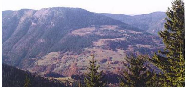
Figure 2. View from Sjekirica

Physical-geographical characteristics and erosion factors. According to the available literature sources, one of the first authors who called attention to the geographical individuality of this Region was Cvijic (1921). In the research of Knezevic and Kicovic (2004) natural characteristics of this area was described; Pavicevic (1956, 1957), Pavicevic and Antonovic (1976) and Spalevic (1999, 2011) characterized erosion processes of the upper part of the Polimlje Region.